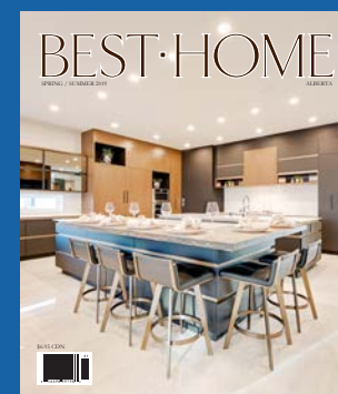
Platinum Signature Homes on page 54