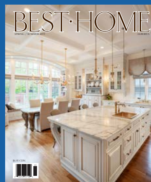
StoneGate Design Build on page 24